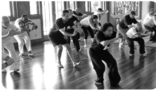
Tai Chi practice improves overall wellness and mental health